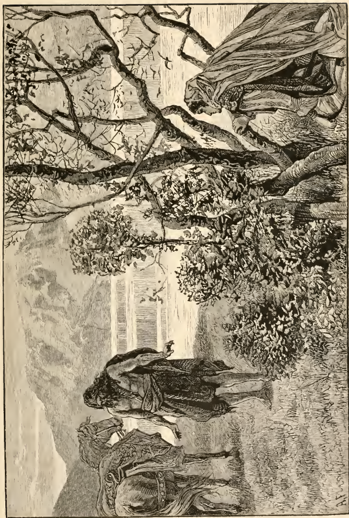
The Recovery of Owain.